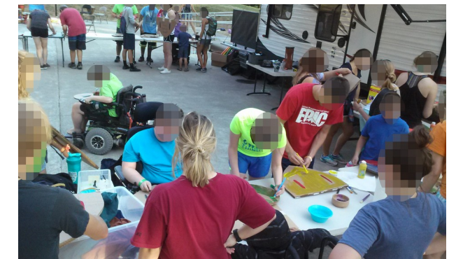
RPG Research at Muscular Dystrophy Association (MDA) 2017