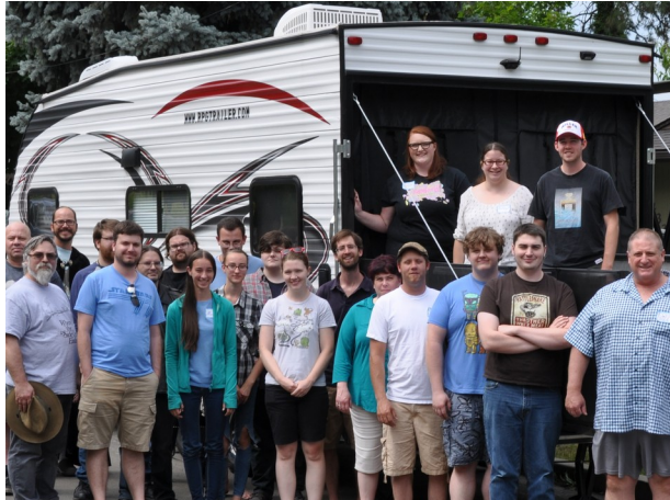
Photo: RPG Research Volunteers in front of Wheelchair Friendly RPG Trailer (2017)